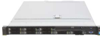
1288H V5 (8-drive)